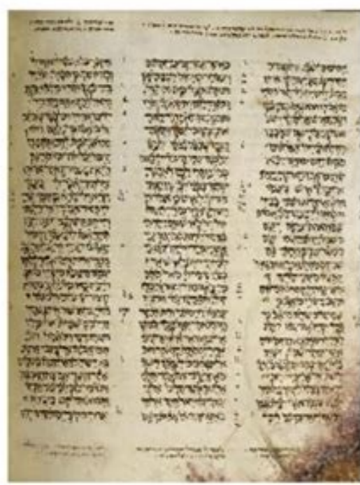
Ruth 1, the Aleppo Codex (10th c. C.E.) www.alepocodex.org